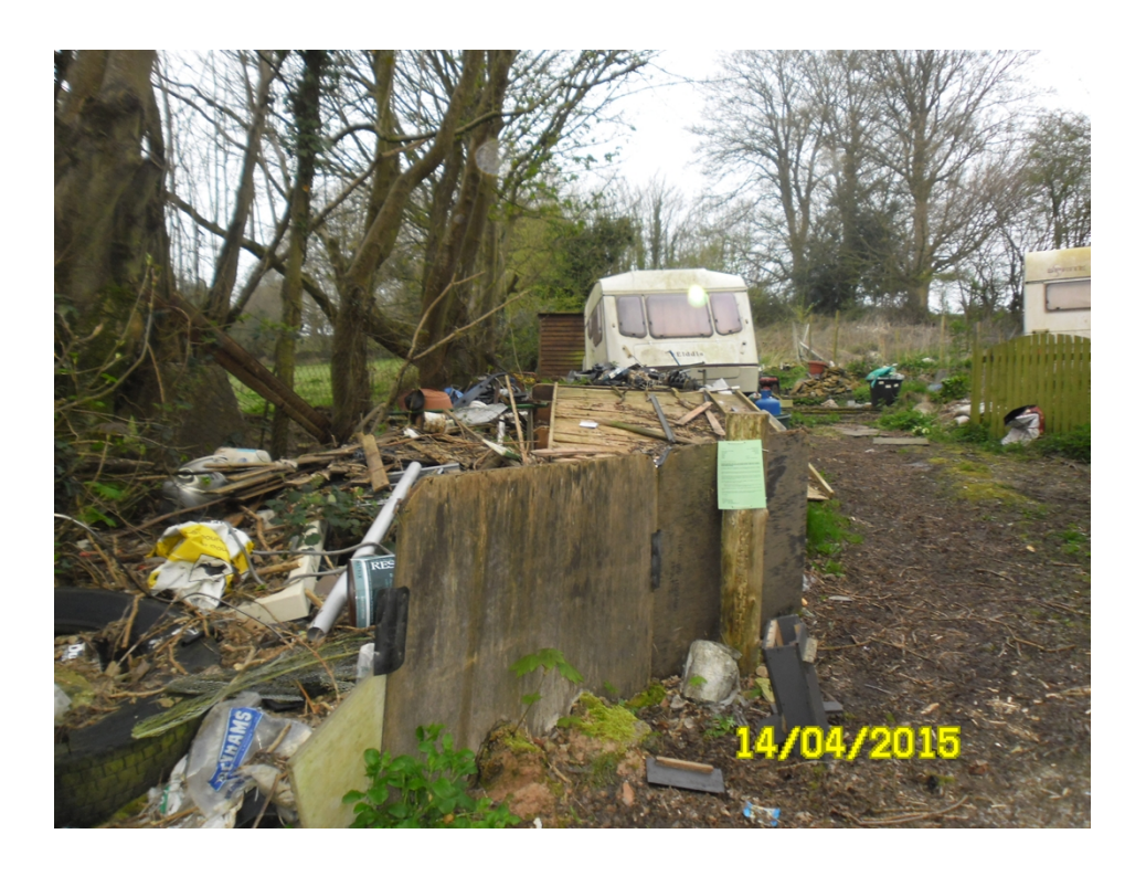
Appearance after direct action:

Appearance of the site prior to direct action: